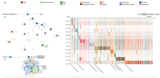
Figure 2: Visual analytics system for topic modelling based user behaviour analysis.

We build probabilistic models, one for each cluster provided through the topic modelling, to assess the anomaly of user activities. A score indicating the likelihood of certain actions being harmless, or harmful, is derived from Long short-term memory models (LSTM) [3]. These models output for each action its probability given the previous actions in the session. The score is then calculated from the probabilities provided by multiple LSTM models: one general LSTM that models the general behaviour of all users in the system, and an LSTM model for each cluster of sessions. The probabilities are then weighted by the similarity of the observed user session to each cluster.